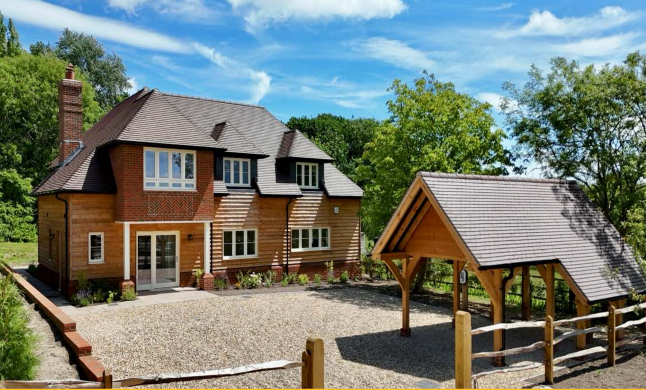
Raglands House Haccups Lane | Michelmersh | Hampshire | SO51 0NP